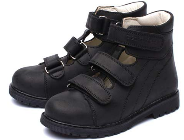
Marseille School 01/01 ● Black Sole ● Black Thread Sizes 20-32