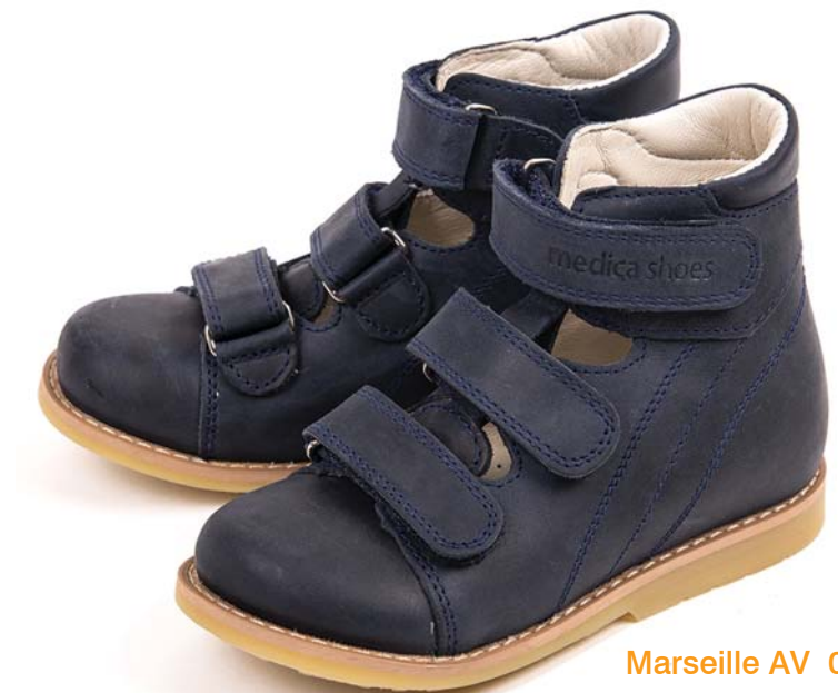
Marseille AV 07/07