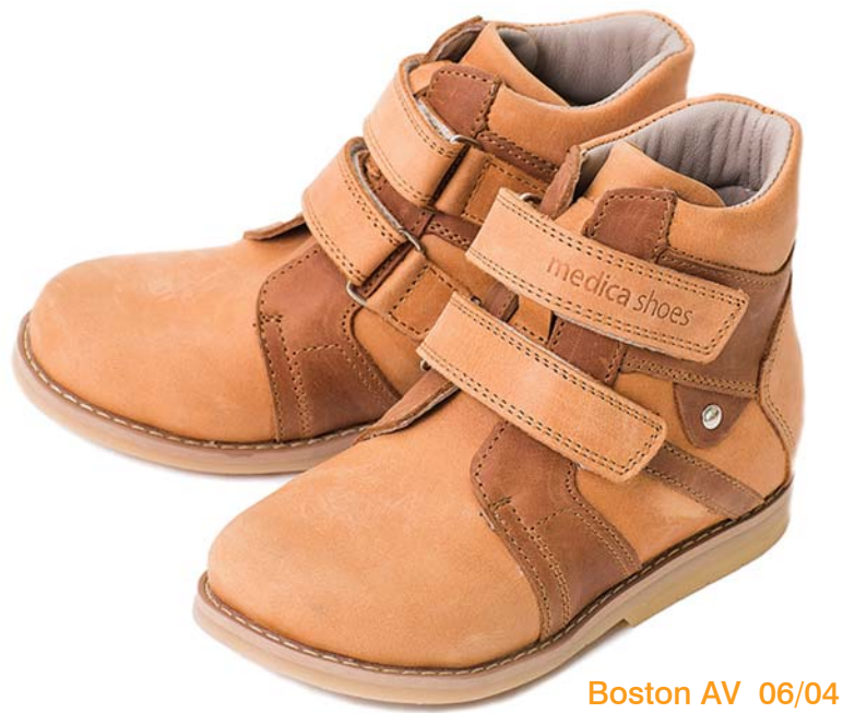
Boston AV 06/04