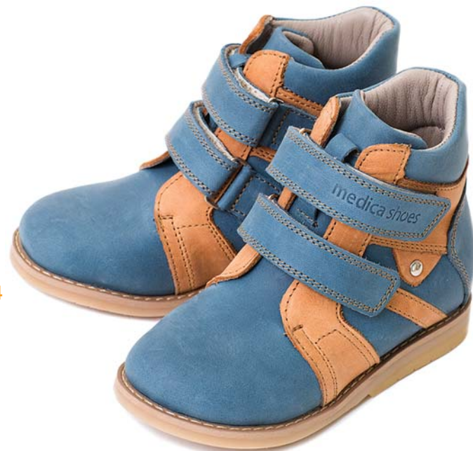
Boston AV 08/06