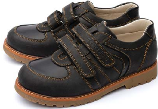
Cambridge School 01/01 ● Natural Sole ● Brown Thread Sizes 20-35