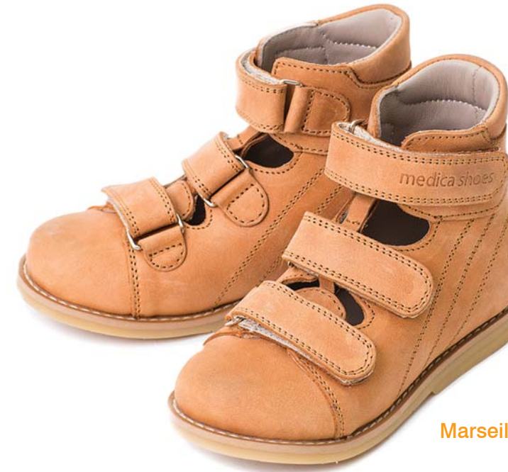
Marseille AV 06/06