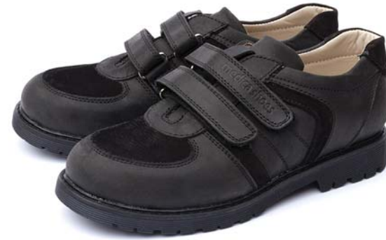
Cambridge School 01/24 ● Black Sole ● Black Thread Sizes 20-35