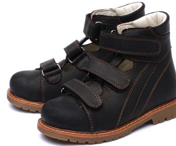
Marseille 01/01 ● Natural Sole ● Brown Thread Sizes 20-32