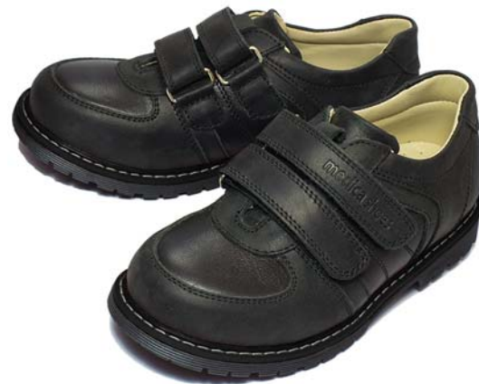
Cambridge School 01/22 Sizes 20-35