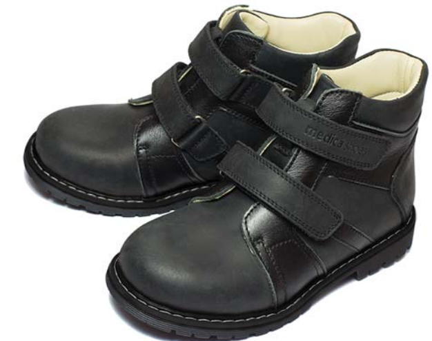
Boston School 01/22 ● Black or Brown Sole ● Black or Brown Thread Sizes 20-36