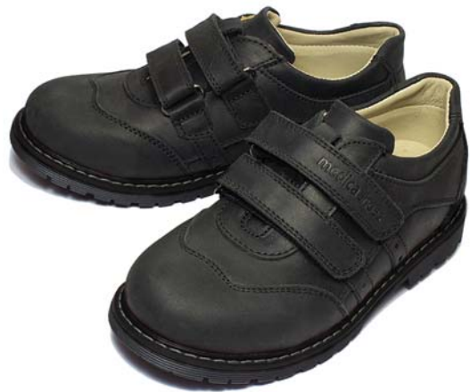
Liverpool School 01/01 Sizes 20-35