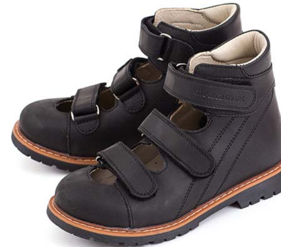
Madrid School 01/01 ● Black or Brown Sole ● Black or Brown Thread Sizes 20-32