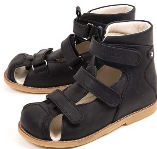
Verona School 01/01 Sizes 20-35