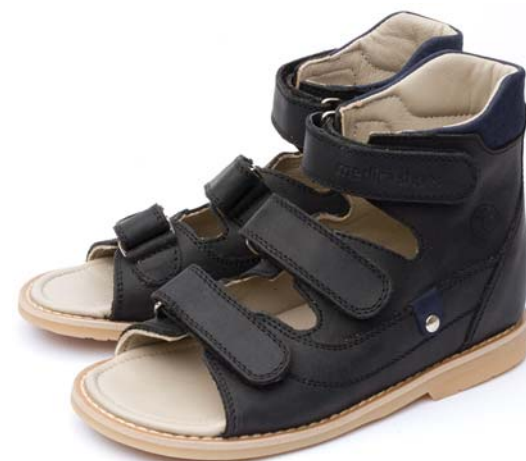
Chicago School 01/01 Sizes 20-35