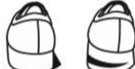
Flare (Item#: 80056-F) Wedge (Item#: 80056-W)