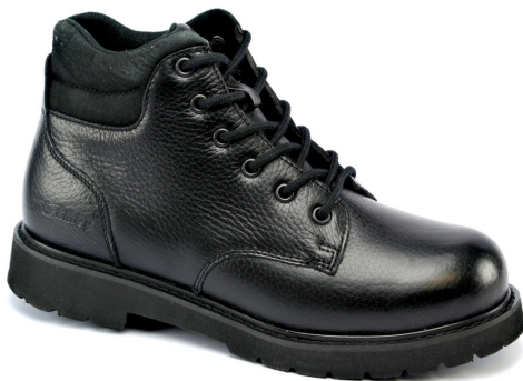
AM5605 6" Boots Black