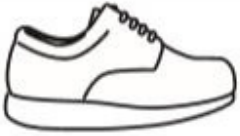
Mild Rocker (Item#: 80042)