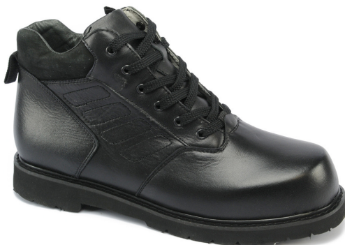
9951 6" Boots Black