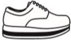
Heel-to-toe Lift (Item#: 80040-F)