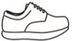
Negative Heel Rocker (Item#: 80046)

One-stop service station for all shoe mods and accommodations!