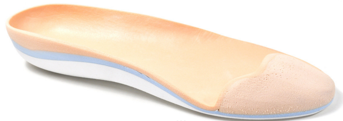
L-5000 Toe Filler