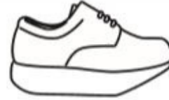
Severe Rocker (Item#: 80049)