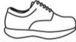
Double Rocker (Item#: 80047)