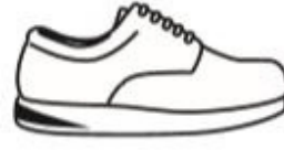
SACH Heel (Item#: 80050)