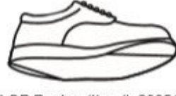
LOP Rocker (Item#: 80051)