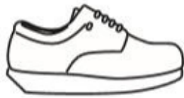
Bevelled Heel (Item#: 80039)

Pick any style from the catalog and we will modify the shoes for you; One low price for each modification.