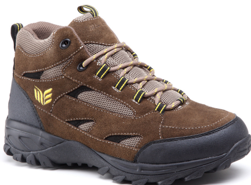
9703-2L Hiking Boots

Genuine leather upper & lining Double or Supra (triple) depth Extended strong medial & lateral counter High Density solid EVA outsole Removable inserts