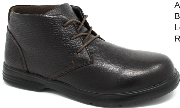
9603 Chucka Boots Brown