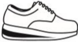
Heel Lift (Item#: 80040-H)