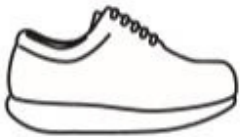
Heel-to-toe Rocker (Item#: 80043)