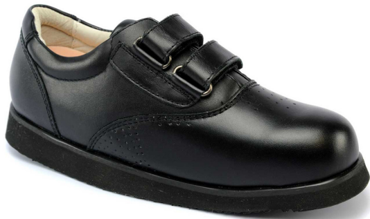
9301-C Charcot Last Black

Size: 5 - 10.5, 11- 15 Width: B, D, 3E, 5E, 7E