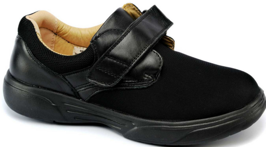
9326 Black Expandable Entrance