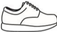
Forefoot Rocker (Item#: 80044)