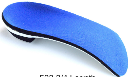
523 3/4 Length