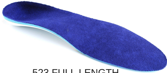
523 FULL LENGTH