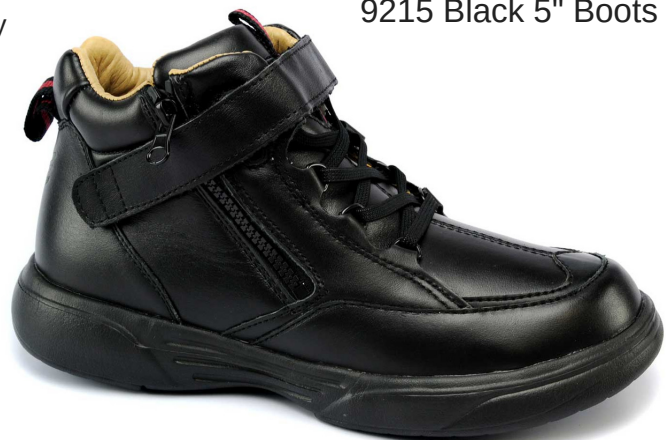
9215 Black 5" Boots