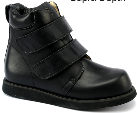
503 Black 8" Boots Supra Depth