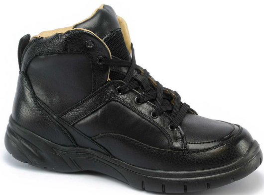
9606 Lace Black