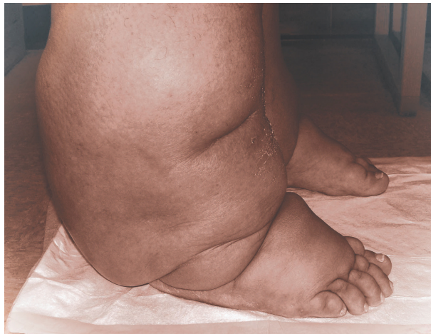
9301-X Accommodator Black