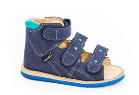
AurelkaOrto 1003 Sandal