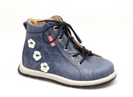
AurelkaOrto 1011 Boot