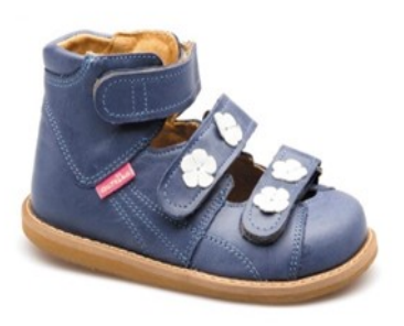
AurelkaOrto 1016 Closed-toe Sandal