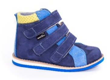
AurelkaOrto 1001 Boot

Style options available from AurelkaOrto in both straight and reverse last are shown below. All styles have several colour options. Please contact Well & Able for colour options once the last and style have been selected.